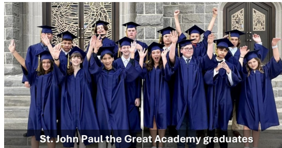
St. John Paul the Great Academy graduates