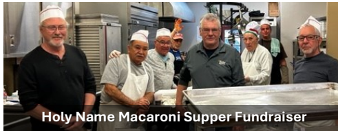
Holy Name Macaroni Supper Fundraiser