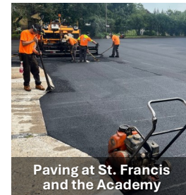
Paving at St. Francis and the Academy