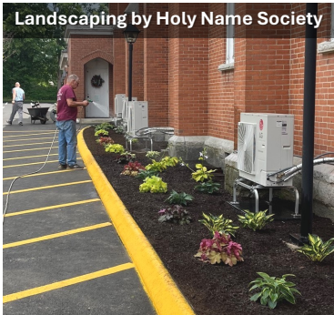
Landscaping by Holy Name Society