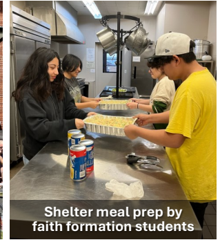
Shelter meal prep by faith formation students