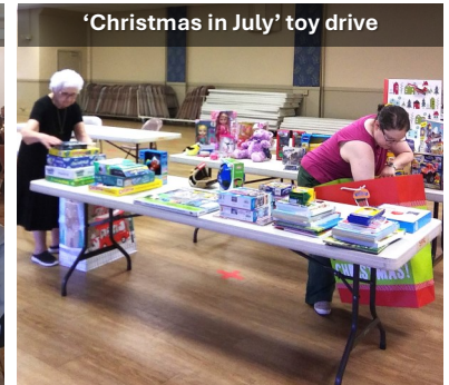
'Christmas in July' toy drive

OUR WORSHIP SITES: ST. FRANCIS OF ASSISI - 160 Main Street • ST. PETER - 107 East Main Street