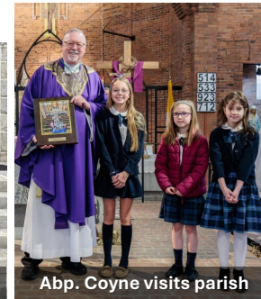
Abp. Coyne visits parish