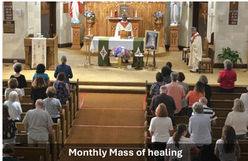
Monthly Mass of healing

'As we look to the future, let us continue to draw strength from each other and from the Lord, who guides our every step.'