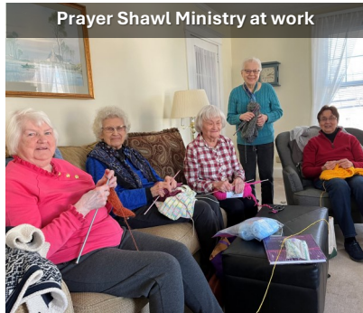
Prayer Shawl Ministry at work