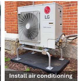
Install air conditioning