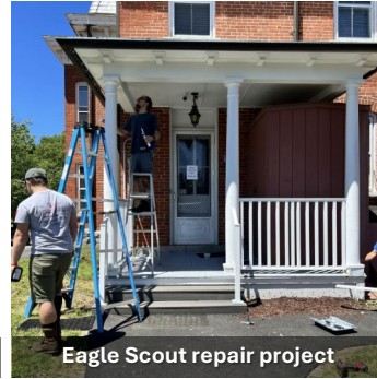
Eagle Scout repair project