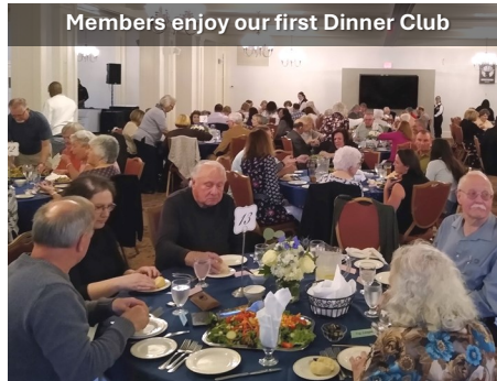
Members enjoy our first Dinner Club