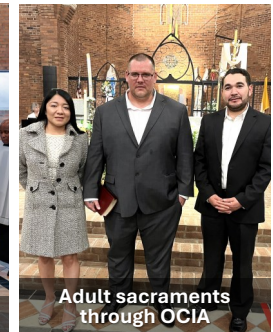
Adult sacraments through OCIA