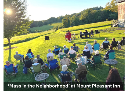
'Mass in the Neighborhood' at Mount Pleasant Inn

Each number in this report tells a story of faith, hope, and love. They reflect your generous spirit and unwavering commitment to not only maintain