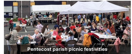
Pentecost parish picnic festivities